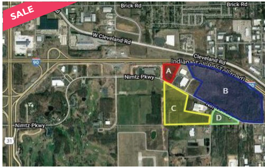
INTERNATIONAL INDUSTRIAL CENTER NIMITZ PARKWAY SOUTH BEND, IN | SOUTH BEND, IN 46628