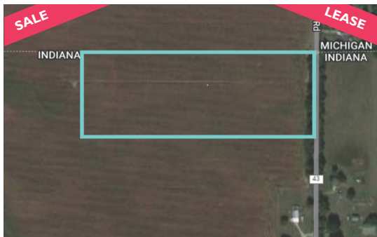
INDUSTRIAL LAND FOR SALE OR LEASE COUNTY ROAD 43, MIDDLEBURY, IN 46507