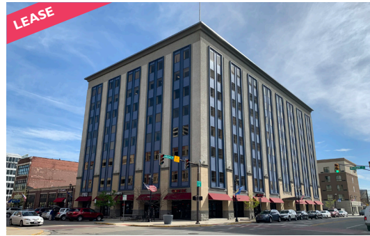
JEFFERSON CENTRE 105 E. JEFFERSON BLVD. | SOUTH BEND, IN 46601