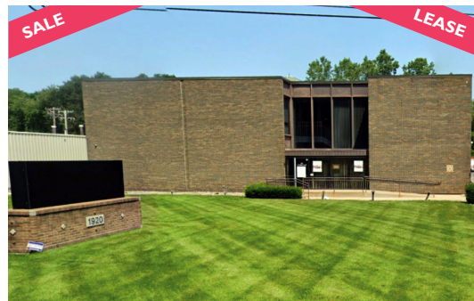
OFFICE FOR SALE AND LEASE 1920 E. MCKINLEY AVE. | MISHAWAKA, IN 46545